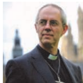
AD2013 : Justin Welby