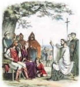
AD597 : St Augustine