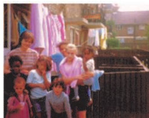
The author in Tottenham with some of the children

www.stpeterscaversham.org.nz/The_Rock_supplements/1211/Art_in_Church.html