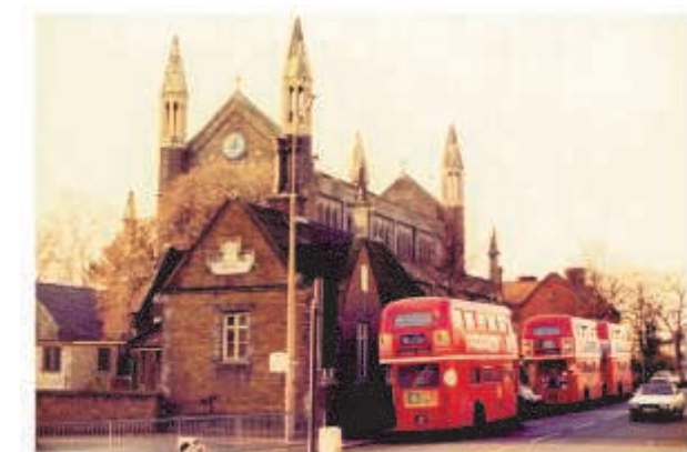
Holy Trinity Tottenham, in the 1980's

Next: An English Public School, Zimbabwe and New Zealand