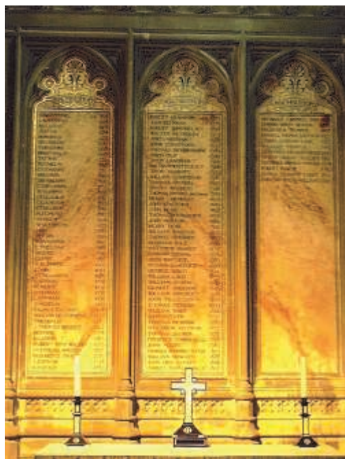
The list of Archbishops of Canterbury in Canterbury Cathedral

Certainly he made mistakes. As he admitted, "It might have helped a lot if I'd gone sooner to the United States when things began to get difficult about the ordination of gay bishops, and engaged more directly." And in this