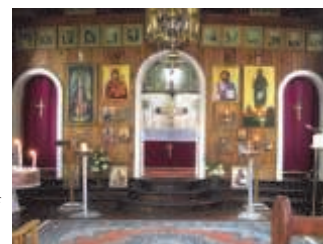
The Antiochian Orthodox Church of St Michael the Archangel

real the passage of time from the inception of the Christian Church to the present day.